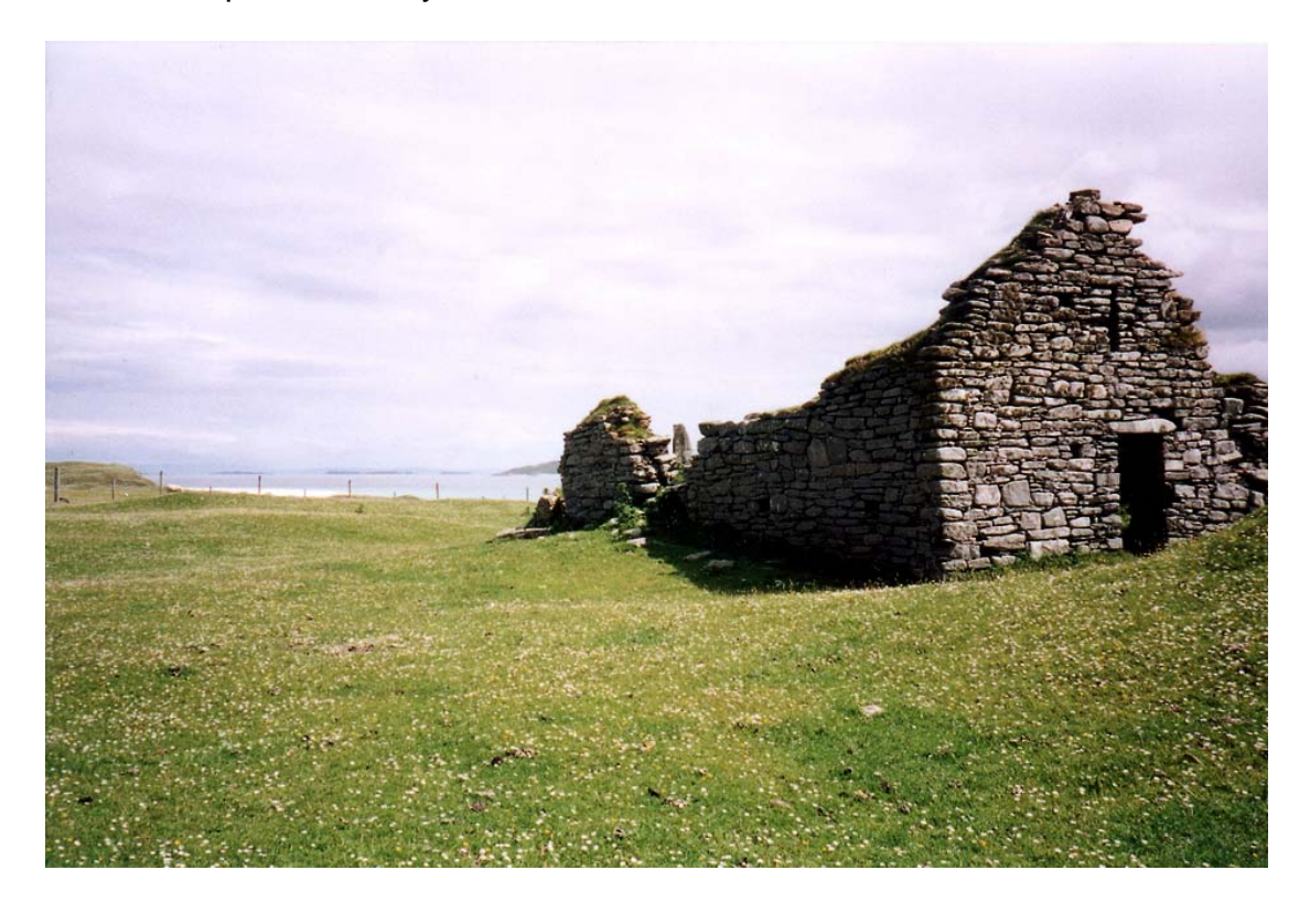
Figure 2: Teampull Mhoire, Pabbay. Anthropogenic, raised soils are located immediately adjacent the site, buried beneath calcareous wind blown sands.