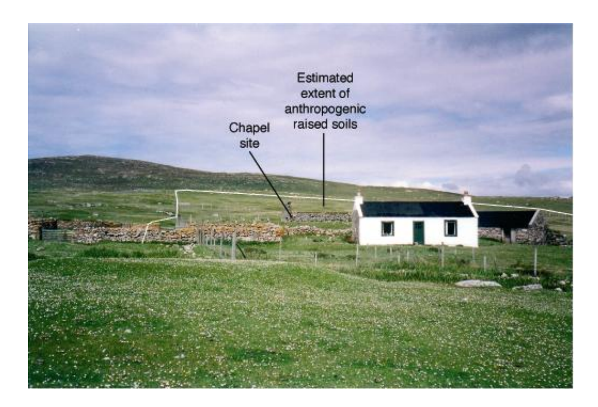
Figure 3: Teampull Mhoire, Pabbay. Anthropogenic raised soils extend at least 150 metres to the north and east of the chapel site, on south and south-east facing slopes. These soils do not extend in front of the croft.

In contrast, extensive survey in Paible, Taransay, revealed no significant evidence of anthropogenic raised soils; soils in the locality are characterised as wind blown calcareous sands with gleyed soils beneath the sands, and peaty gleys. It may be, however, that evidence of earlier arable and raised soils is buried at depth beneath sand, or that arable areas have been lost to coastal erosion. Evidence of midden deposits up to a metre in thickness were however identified immediately beneath and adjacent to St. Keith's chapel (Figure 4). This midden material is characterised as dark brown and dark grey brown sandy silt loam and silt loam with the occurrence of shell, small charcoals and small domestic mammal bone fragments (Table 3b). These observations imply that the chapel site was founded on earlier site occupation, suggesting that the papar may have settled in an already full landscape. This discovery opens up the prospect of examining relationships between incoming Celtic ecclesiastical settlement and earlier occupants of the landscape – were the papar given these locations; did the existing residents stay or did they move?