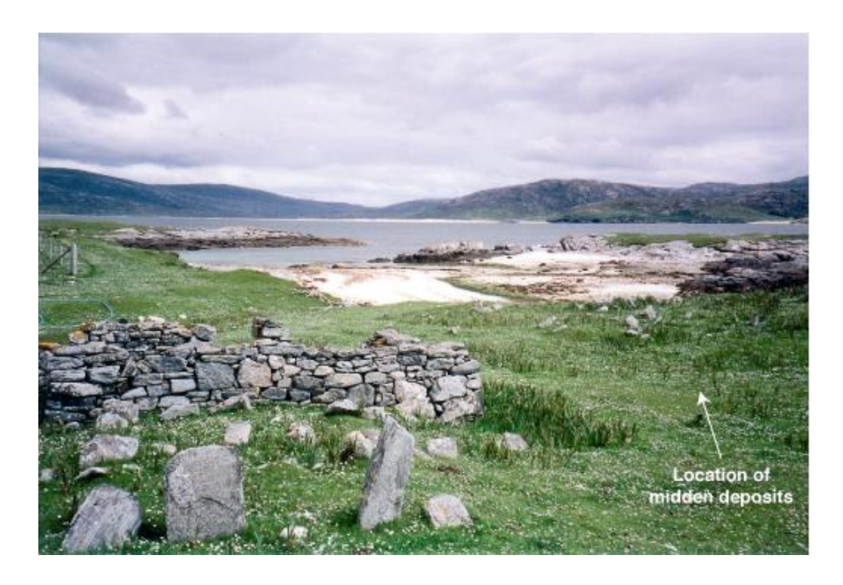
Figure 4: St. Keith's Chapel, Taransay. Midden deposits up to a metre in thickness are identified immediately adjacent the chapel site.